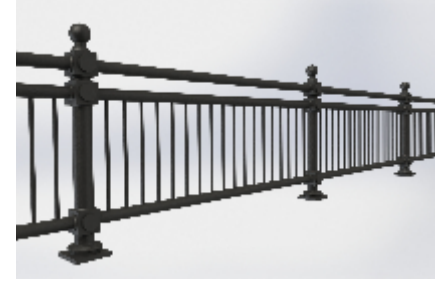
Post and Panel With Top Rail