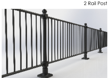
Post and Panel