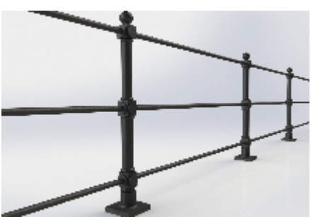
3 Rail Post