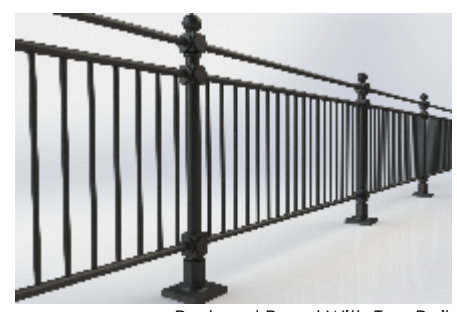
Post and Panel With Top Rail