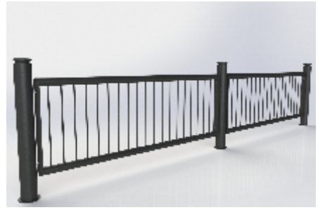
Shown powder coated