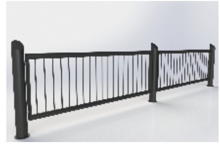
Shown powder coated